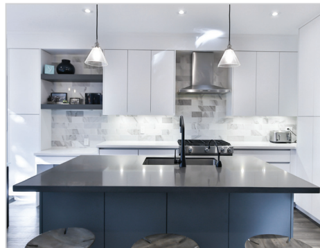
Appliance and Countertops

RX10 matte thermoplastic polyurethane film designed to protect commercial monitors, personal devices, and other surfaces.